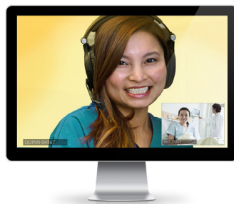
Crystal Clear Video and Sound