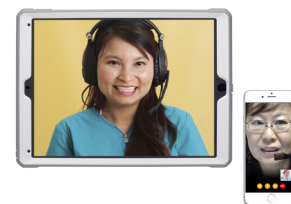
App available on iPad and iPhone