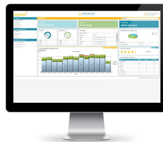
Dashboard Analytics with Vital Usage Data